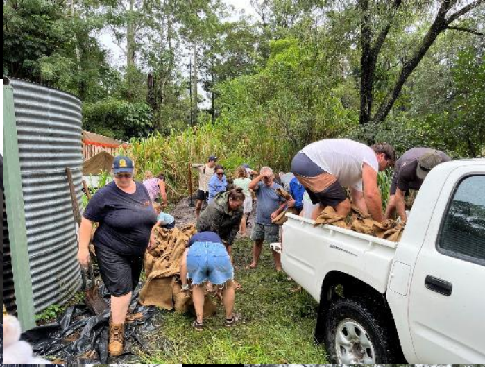
Locals filling sandbags in preparation for the rising flood waters