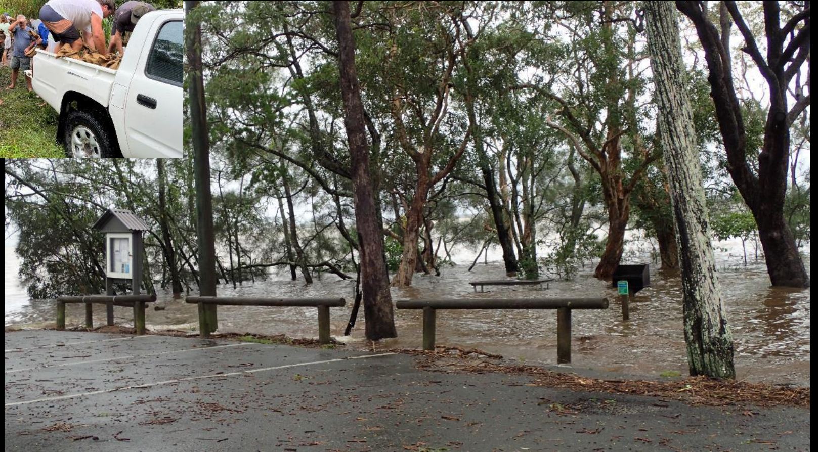
Lake Cootharaba Sailing Club and across the road - Boreen Parade